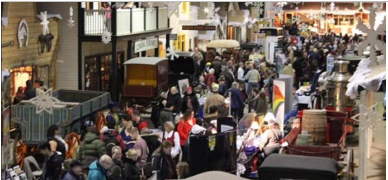
The main floor of the Saskatoon Heritage Festival 2022, at the Western Development Museum.